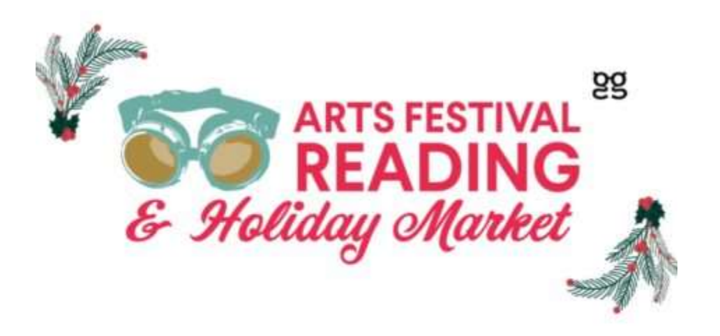
Arts Festival Reading, December 4th & 5th, 2021

Federation of Reading's Anti-Hate Summer Reading Program (4th photo), the Berks Social Justice Youth Initiative (5th, 6th, and 7th photos), Barrio Alegria's Timebank project (8th photo), and ReadingFilmFEST (9th photo).