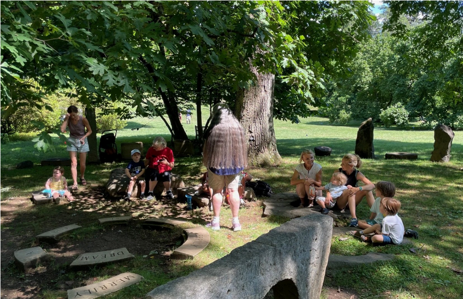
Families gather at the shady Story Stones to enjoy the week’s story.